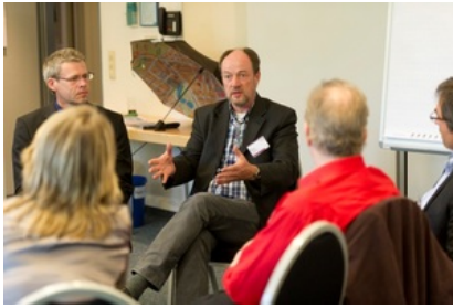
A Reality Check Workshop featuring the City of Copenhagen at Resilient Cities 2012

studies with two Reality Check Workshops (Tshwane, South Africa and Pemba/Quelimane, Mozambique) and one in-depth session on post-disaster resilience-building in New York City.