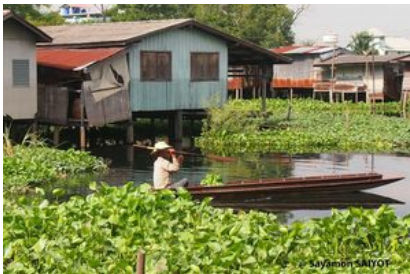
@ 2013 Sayamon Saiyot