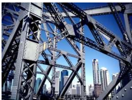
Story Bridge, Brisbane, Australia