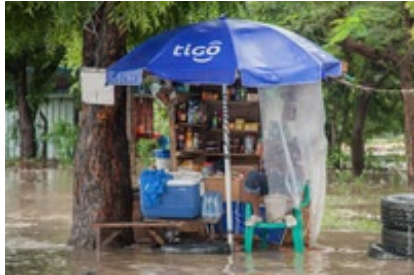
© Eric Schaechter - UFZ Resilient Cities photo contest final winner in 2014