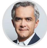
Miguel Ángel Mancera