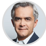
Miguel Ángel Mancera